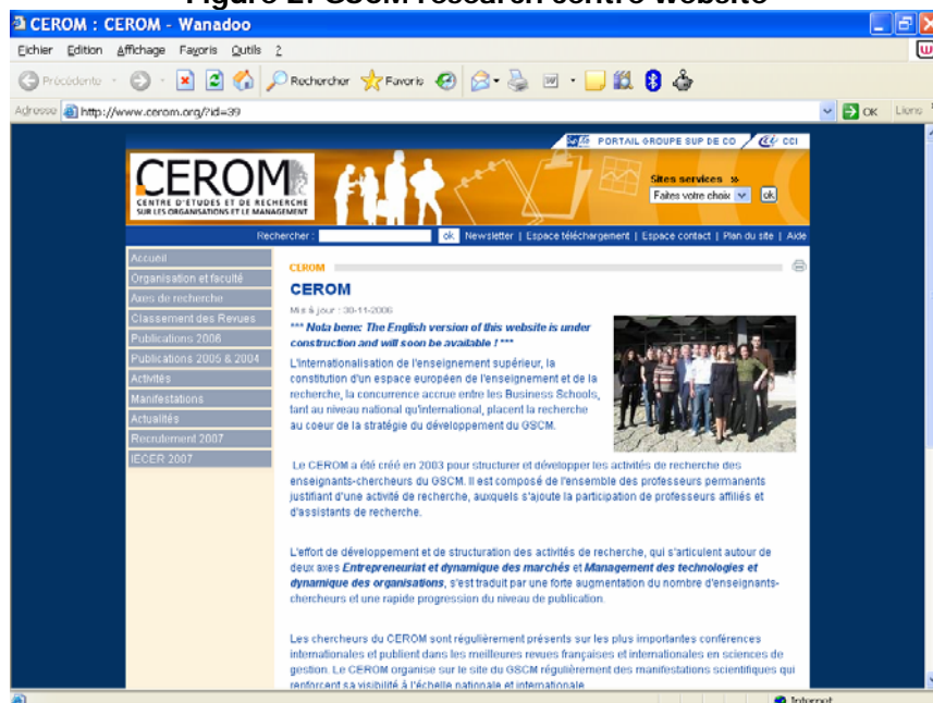
Figure 2: GSCM research centre website

The new website of the research center has been implanted in autumn 2006. The French version is finished and the English version will be available at the end of the first semester 2007.